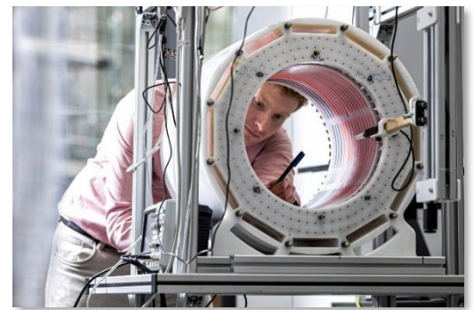
Figure 1: Image of the portable low-field MRI system in our laboratory. The scanner consists of hundreds of permanent neodymium magnets, arranged in a Halbach configuration to create the static 50 mT B_0 field.

We offer a collaborative culture in a dynamic team of students, PhD candidates, and postdocs that values new ideas and lively discussion. A workstation can be provided in our student office, together with modern IT infrastructure that includes around 2000 CPU cores and 100 GPUs, including multiple NVIDIA RTX PRO 6000 class server GPUs. You will also have access to a workshop and rapid prototyping facilities, including 3D printers with multi toolhead capability, to support fast iteration from design to hardware.